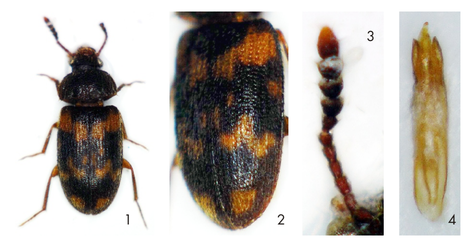
Figs. 1-4. Mycetophagus (M.) ruzickai sp. nov.: 1-habitus, dorsal aspect; 2-right elytron; 3-antenna; 4-male genitalia.